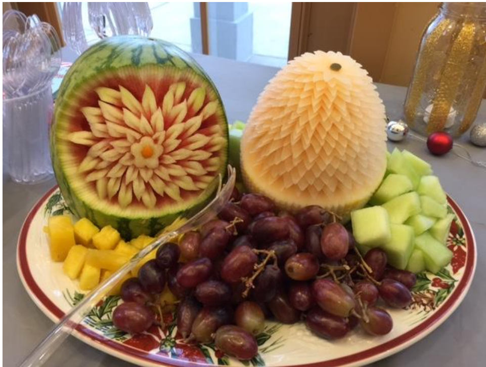
Food carving from Kevin Molidor's dad!