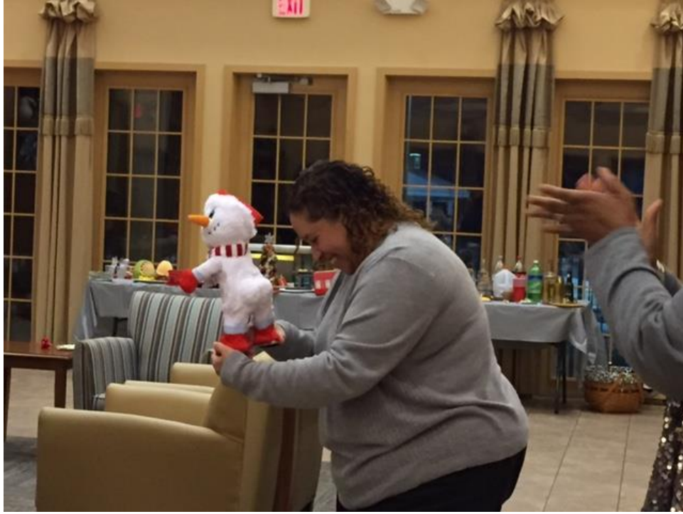
Nia with the Twerking Snowman!